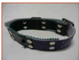
The arm section

Section 2 is clipped onto section 1 in two places, on the outside of the arm section. The attachment feature means that the forward section of the sling places no pressure on the section around the arm. The forward sling section is also micro adjustable. The major benefit of this is that the sling which is supporting the rifle is not compressing the arm, and thus pulse is not transmitted through the sling. This sling is right or left handed.