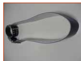
Overview of the complete sling

The new MEC sling has a band which encircles the arm, (also non slip material on the inside) and this has a second layer which is attached to the outer section of the first layer. The sling part which attaches to the hand-stop is connected to this second layer and can self position along this part.