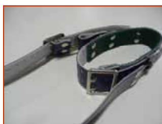
The front section attached to the arm section