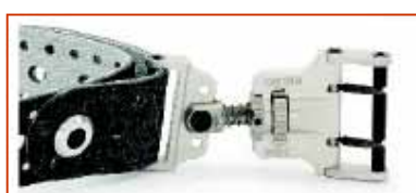
Detailed views of the recently released MEC sling